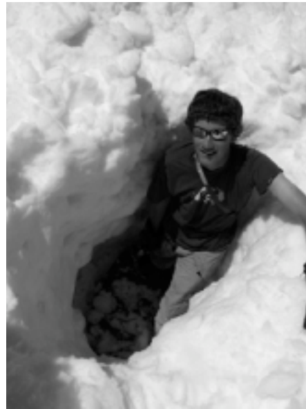
Figure 1. Excavating with no strategy usually produces a hole which compromises the victim's air pocket and the rescuer's maneuverability.

(Figure 1). Often the rescuers were standing directly on top of the victim, compromising the air pocket. Rescuers would invariably excavate in a cone shape down to the victim. Once deeper than their waists, rescuers were no longer able to throw snow clear of the hole, but had to lift it above the sides and deposit it. This creates high walls around the hole and exacerbates the problem of removing snow from the excavation area. By the time the rescuers reached the victim, the snow being removed often came right back into the hole and on to the victim again. It is not difficult to imagine the stress and possible harm this would cause to a live avalanche victim.