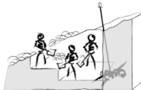
Figure 5. In burials deeper than two meters, it can be difficult to clear snow from the hole. Instead, it should be lifted to the next terrace, where it is removed by a secondary shoveler.

Deep burials of two meters or more may require an intermediate step in removing snow from the excavation area. At this depth it can be difficult to throw snow clear of the hole even with a terraced design. In this case, the primary shovelers should lift their snow to the level of the secondary shoveler(s). The secondary shoveler(s) can then clear it from the hole. If there is more than one secondary shoveler, then one should leave the hole to rest and prepare for first aid and evacuation. The primary shovelers can then use this vacant area to dispose of their snow. The remaining secondary shoveler then clears it from the hole (Figure 5).