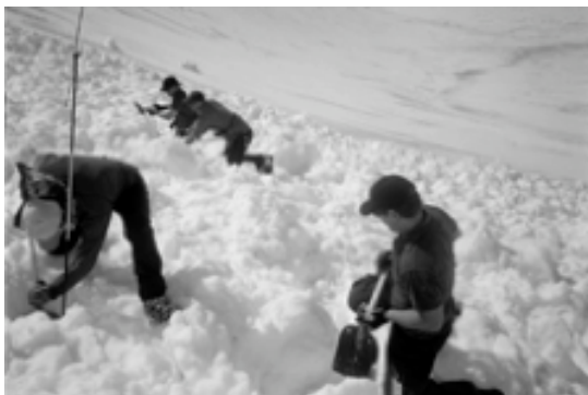
Figure 4. Shoveling side-by-side (background) was more efficient than shoveling in line (foreground). In the latter technique, the primary rescuer shoveled tentatively and the secondary shoveler was often idle.

At this site, we confirmed that a hole length of 1.5 times the burial depth was optimal even in hardened avalanche debris and at varying slope angles. Shorter hole lengths resulted in final holes with steep sides and lack of maneuverability. Tests with more than one rescuer confirmed greater efficiency operating side-by-side, as described above, than in line. Rescuers using the latter technique would always shovel more cautiously and tentatively to avoid striking the secondary shoveler with snow or their shovel blade. Invariably the secondary shoveler would be waiting for shovelfuls of snow from the primary shoveler so he could then move that snow from the area (Figure 4). While this provided needed rest for the secondary shoveler, it was an inefficient allocation of manpower compared to the side-by-side method.