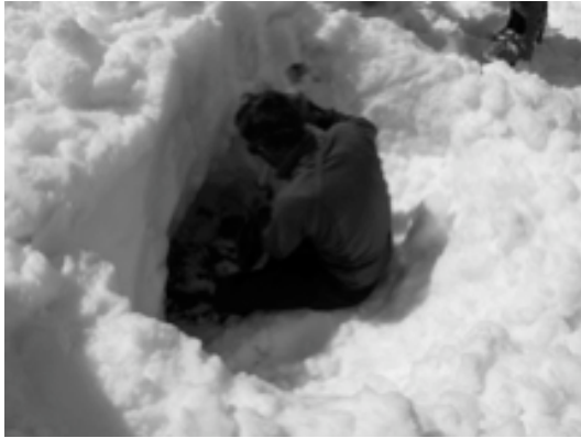
Figure 2. Proper terracing allows better snow removal and maneuverability for the rescuer. Sitting or kneeling is more ergonomic than standing.

level can be excavated closer to the victim, creating a “terrace” effect up to the surface, as suggested by Pfisterer. The starter hole already excavated enables shovelers to throw snow clear of the hole instead of lifting and depositing it on the sides (Figure 2).